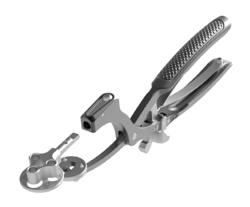
Figure 2 Assemble the Desired Truliant Patella Drill Guide to the Truliant Spiked Patella Prep Handle