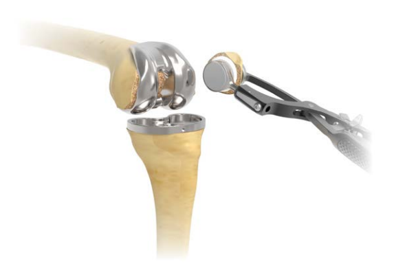
Figure 3 Assemble the Truliant Patella Clamp Head to the Truliant Spiked Patella Prep Handle and Clamp Patella Component Onto Bone