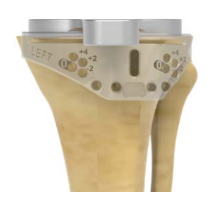
Figure 15 Placement of 2mm Re-Cut Referencer Assembly on the Proximal Tibia