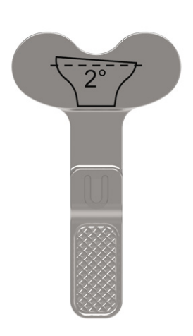
Figure 9 Truliant 2° Varus/Valgus Re-Cut Referencer

Assemble the 2° Varus/Valgus Re-Cut Referencer to the Tibial Resection Guide (Figure 10).