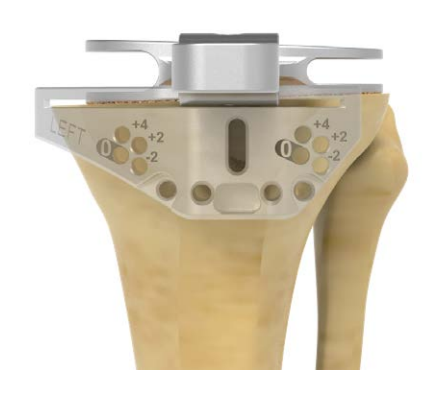
Figure 11 Placement of 2° Varus/Valgus Re-Cut Referencer Assembly on the Proximal Tibia