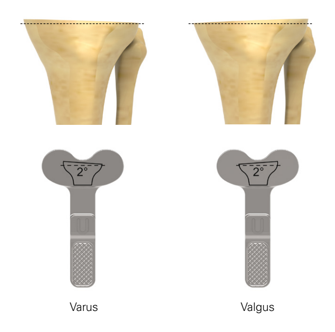
Figure 12a Orientation of Varus/Valgus Re-Cut Referencer for a Left Knee

Place the 2° Varus/Valgus Re-Cut Referencer assembly on the cut surface of the proximal tibia in the correct orientation to achieve the desired tibial resection (Figures 11, 12a and 12b). Pin the Tibial Resection Guide in place using the zero holes and proceed to make the proximal tibial resection.