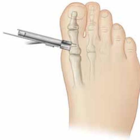
Figure B Drill the Pilot Holes