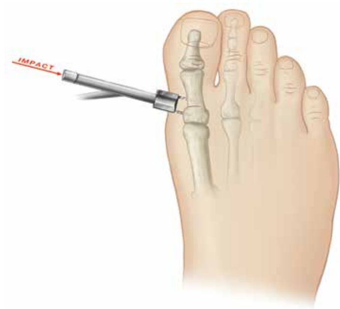
Figure 4 Insert the Staple