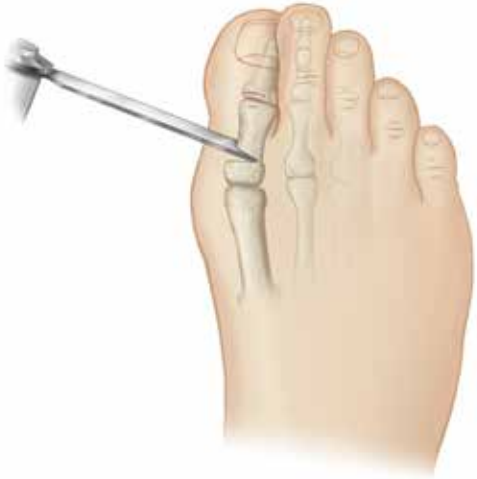
Figure A Resect the Phalanx Medially