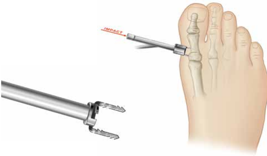
Figure C Insert the Staple