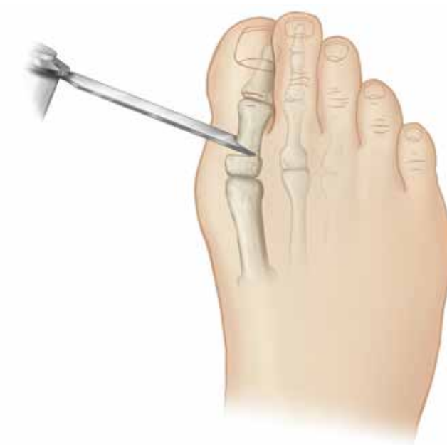
Figure 1 Resect the Phalanx Medially

Perform a medial incision to expose the proximal phalanx. Use an Oscillating Saw to create a wedge on the medial side of the phalanx at an angle determined by the surgeon, based on intraoperative assessment.