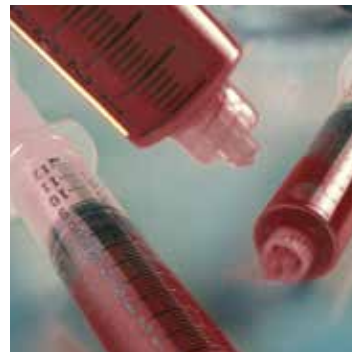
4X Concentration of Bone Marrow Cells 2