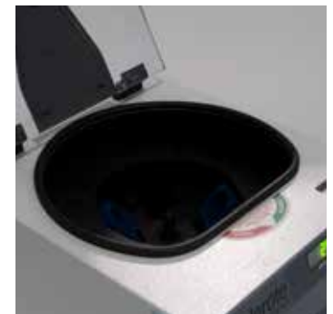
52mL BMA = 6mL BMC in 12 minutes 1