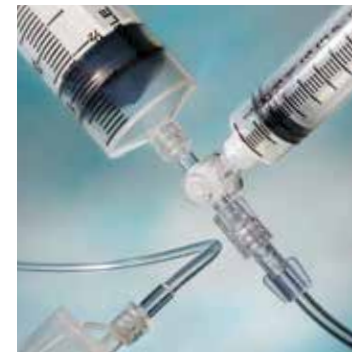
Closed System Eliminates Possible Transfer Contamination